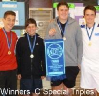
Winners C Special Triples