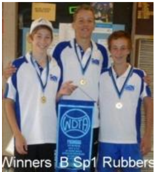
Winners B Sp1 Rubbers