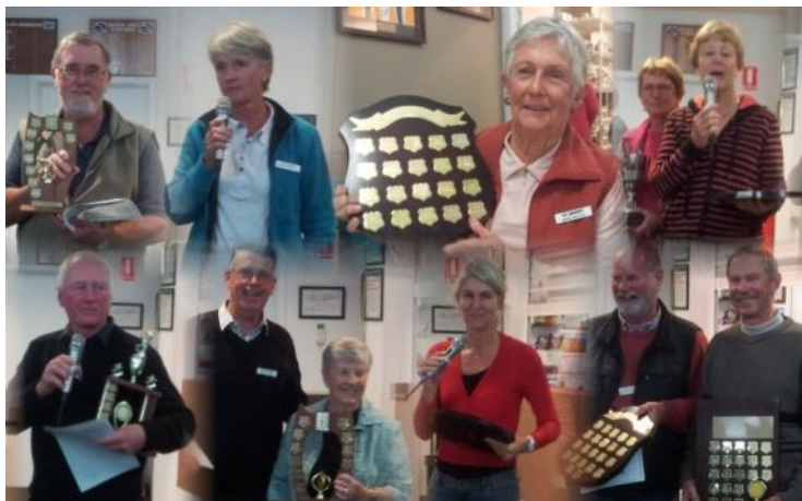
Pictured: Club Championship winners