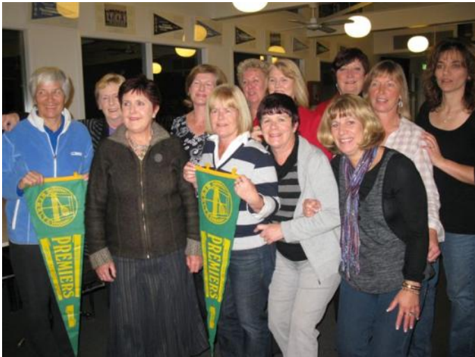
Mid-week ladies celebrate two A-Grade premierships A3&A4