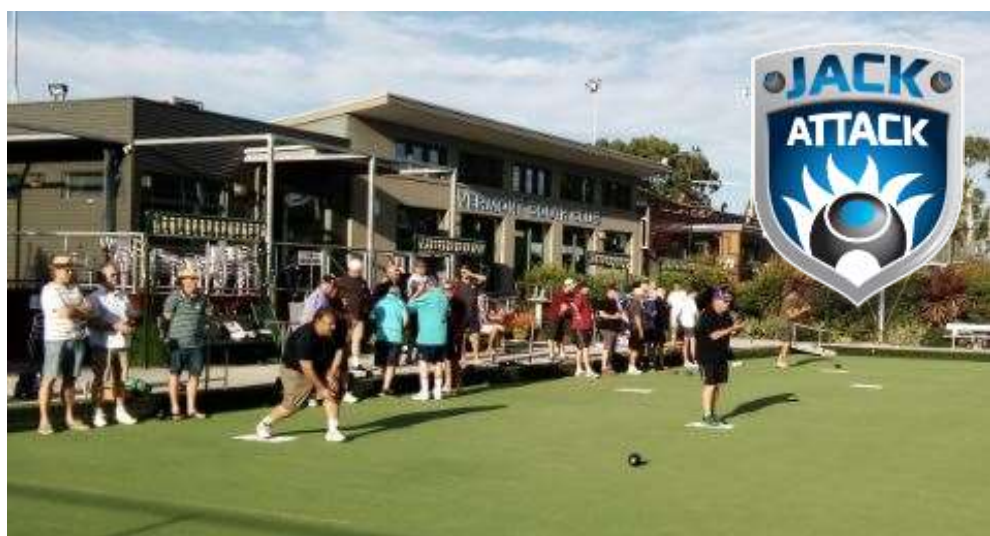
Our inaugural Jack Attack season in March 2017