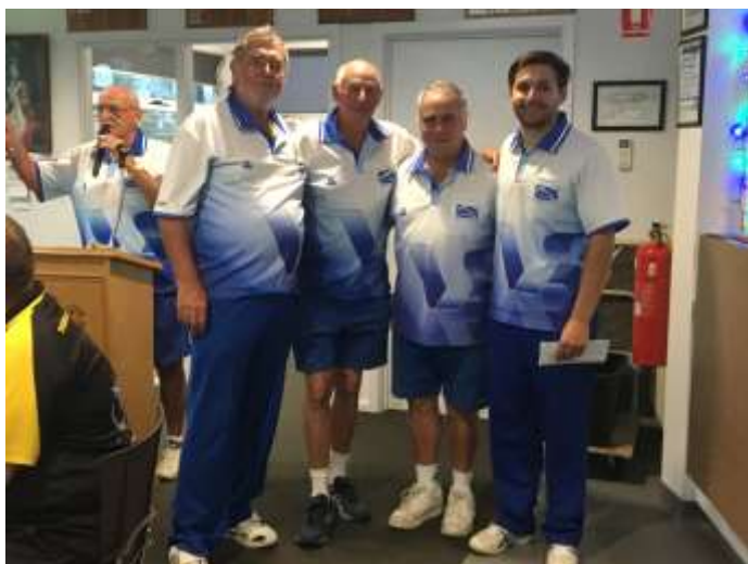
Pro-Shot 2017 Tournament winners