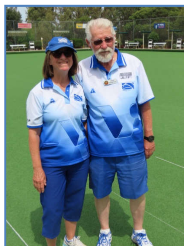
Our 2022 Singles Champions