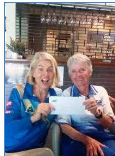
Region 2022 W Pairs Champions